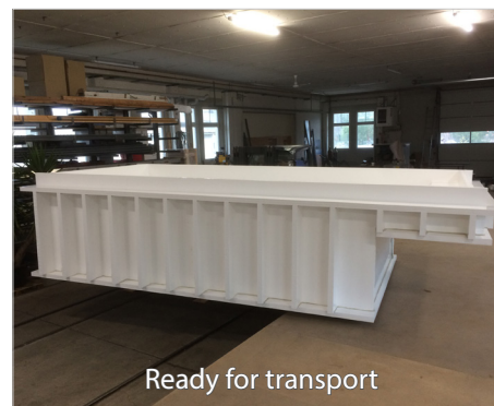
Ready for transport