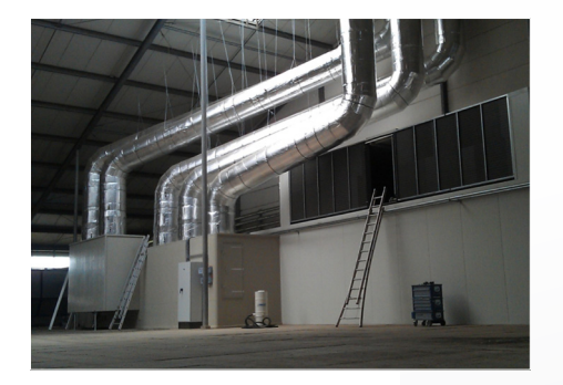
INDUSTRIAL AIR SCRUBBERS