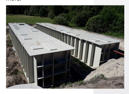
WASTEWATER TREATMENT TANKS

Choose Paneltim® panels for the construction of liquid tanks, fish tanks, water reservoirs, swimming pools, swimming ponds, grease traps, and more.