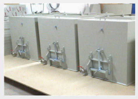
LIVE FISH TRANSPORT TANKS