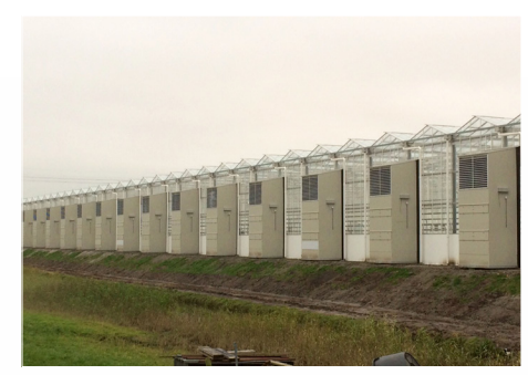
HEAT RECOVERY SYSTEMS